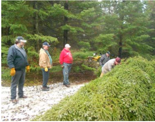
The team closes in on the quarry.