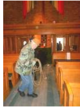
Dragging the trees to their resting place before they are put in place.