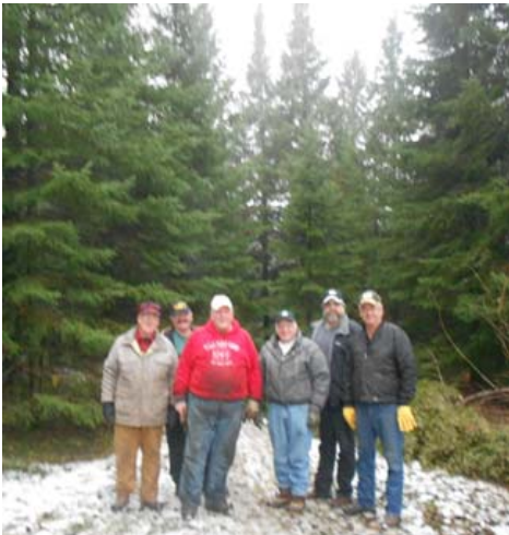
The team takes a break for the paparazzi!