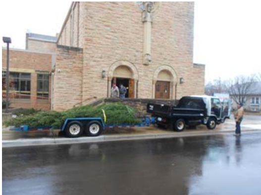
Safely at Saint James!