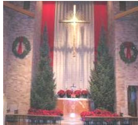
A perfect fit!