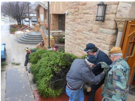
Bringing the trees into the sanctuary.